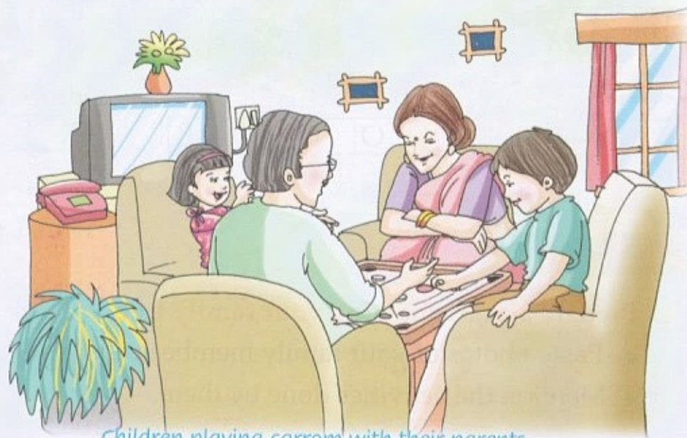
Children playing carrom with their parents