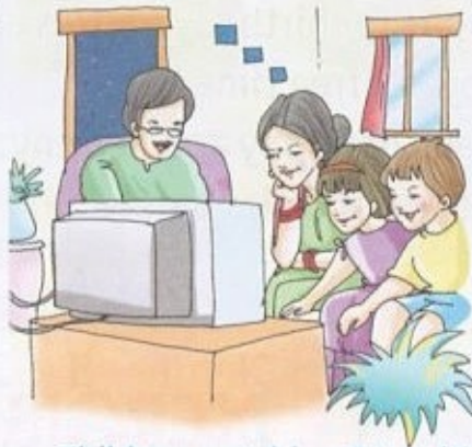
Children watching T.V. with their parents

We should play safely and have fun. It feels nice to enjoy together.