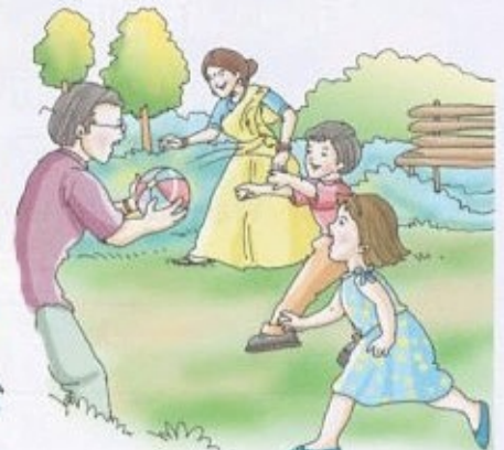
Children playing with their parents