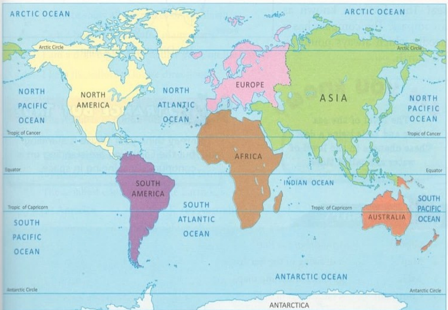
Continents and Oceans on the Earth